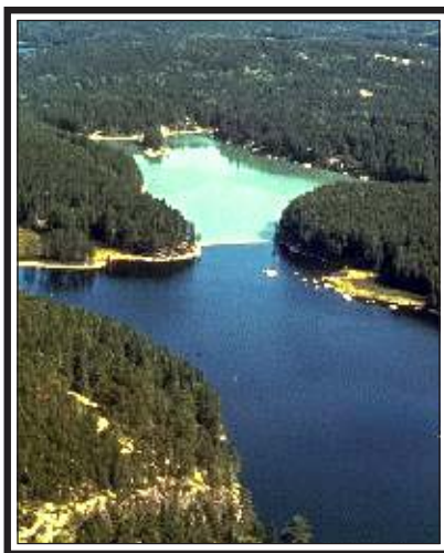
A view of divided Lake 226, circa 1973. Both ends of the lake were being fertilized with weekly additions of nitrogen and carbon. The northeast basin (background) was also receiving additions of phosphorus, resulting in the surface algal bloom, so clearly evident.

photo, below) so clearly demonstrated, phosphorus is the key to controlling eutrophication problems in most lakes.