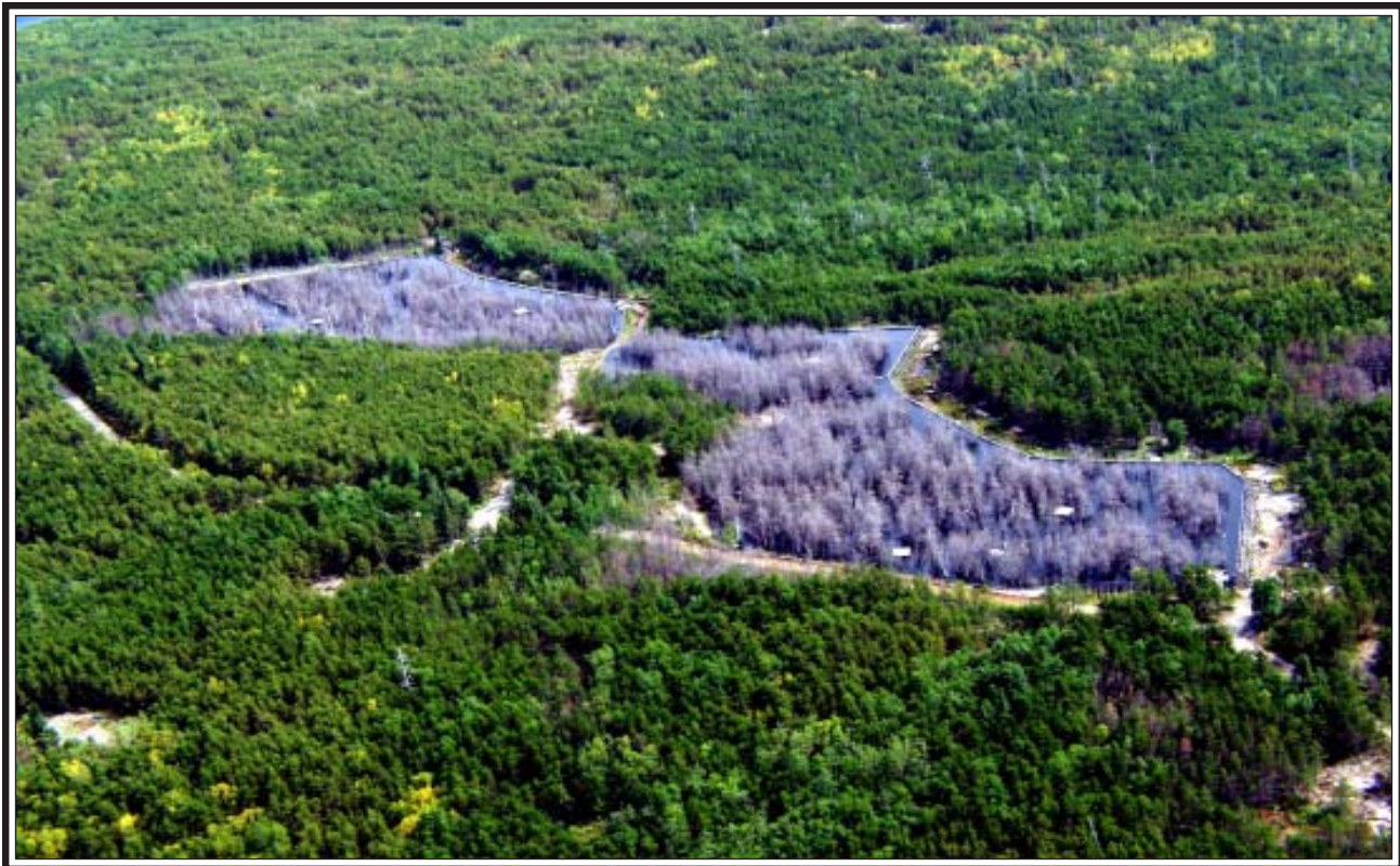
Artificial Reservoirs 2 and 3 of the FLUDEX project, viewed in August 2002. Obviously, the forest has been killed by the flooding. Less obvious are the toxic methyl mercury produced and the greenhouse gases (carbon dioxide and methane) released to the air.

kills. We continue to monitor and document the recovery of this lake ecosystem, demonstrating that even severely acidified lakes are capable of gradual recovery, if acid inputs are curtailed.